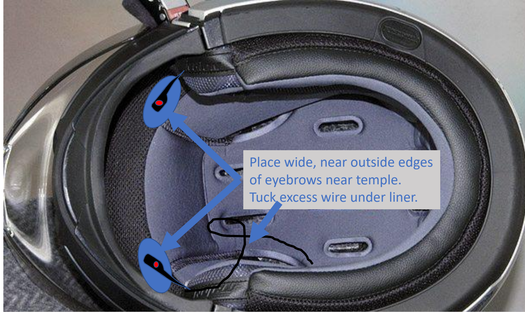
UCLEAR Pro Microphones Placement

Tuck excess wire under the headliner and refit your headliner over the microphones. When headliner and padding is replaced, none of the microphones or wires should be visible.